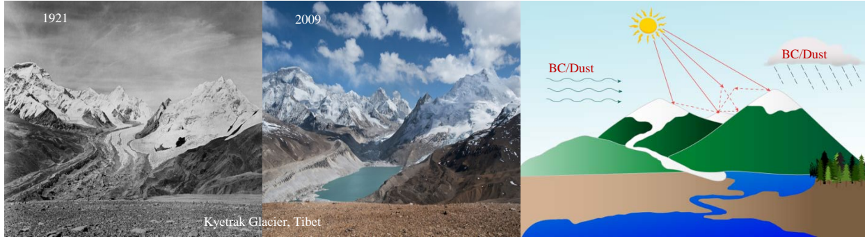
FIGURE 1. The left and center pictures are photographs taken by E. O. Wheeler in 1921 and D. Breashears in 2009, respectively, of the Kyetrak Glacier in Tibet, illustrating a substantial retreat of glacier over the last 80 years. The picture on the right depicts the theme of this presentation, namely the transfer of solar radiation in 3D and inhomogeneous mountain and snow surfaces and wet and dry deposition of black carbon and dust particles in snow layer.

temperature and snow accumulation appears to demonstrate that the reduction in snow in that area is related not only to surface air temperature, but also to an increase in BC. The right picture in Fig.1 depicts the theme of this presentation, namely the transfer of solar radiation in 3D and inhomogeneous mountain and snow surfaces and wet and dry deposition of black carbon and dust particles in snow layer. Both radiative processes are closely associated with snow dynamics at mountain surfaces and the consequence of regional climate change.