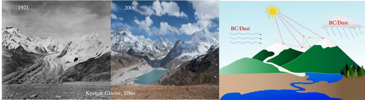
FIGURE 1. The left and center pictures are photographs taken by E. O. Wheeler in 1921 and D. Breashears in 2009, respectively, of the Kyetrak Glacier in Tibet, illustrating a substantial retreat of glacier over the last 80 years. The picture on the right depicts the theme of this presentation, namely the transfer of solar radiation in 3D and inhomogeneous mountain and snow surfaces and wet and dry deposition of black carbon and dust particles in snow layer.

temperature and snow accumulation appears to demonstrate that the reduction in snow in that area is related not only to surface air temperature, but also to an increase in BC. The right picture in Fig.1 depicts the theme of this presentation, namely the transfer of solar radiation in 3D and inhomogeneous mountain and snow surfaces and wet and dry deposition of black carbon and dust particles in snow layer. Both radiative processes are closely associated with snow dynamics at mountain surfaces and the consequence of regional climate change.